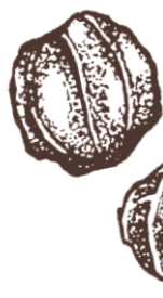
Juglans Clarno Formation Fossil, Oregon