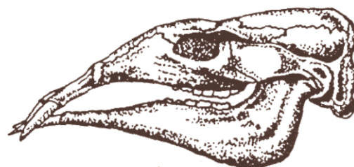
Desmostylia Astoria Formation Newport, Oregon