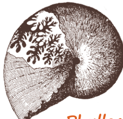
Phylloceras Snowshoe Formation Suplee, Oregon