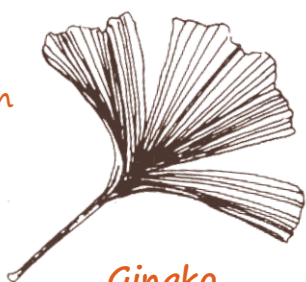
Ginkgo Clarkia Formation Clarkia, Idaho