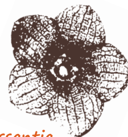
Florissantia Klondike Mountain Formation Republic, Washington

Celebrating 150 Years of Paleontological Search and Rescue in the Pacific Northwest