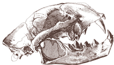
Nimravus John Day Formation Kimberly, Oregon