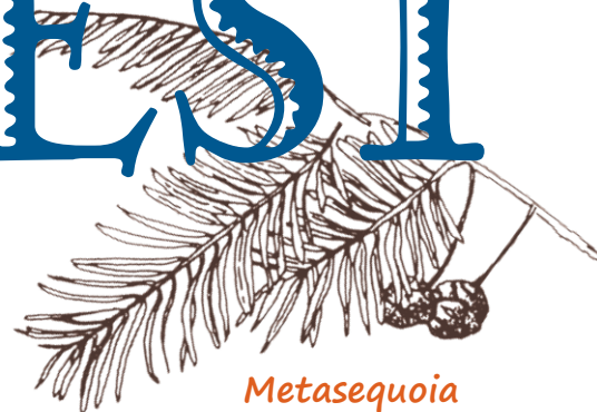
Metasequoia Bridge Creek Flora Mitchell, Oregon