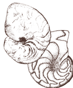
Aturia Lincoln Creek Formation Knappton, Washington