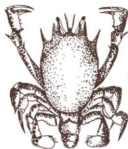
Ranina Keasey Formation Mist, Oregon