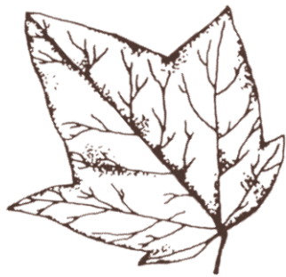
Acer Lyons Flora Formation Lyons, Oregon